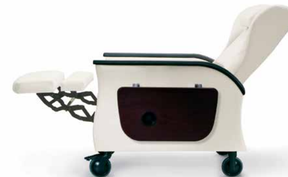
Shown reclined with optional headrest and folding side table