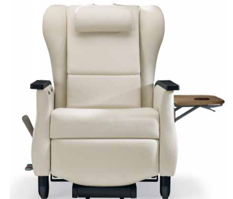
Shown upright with optional wide arm caps, headrest, footrest and folding side table