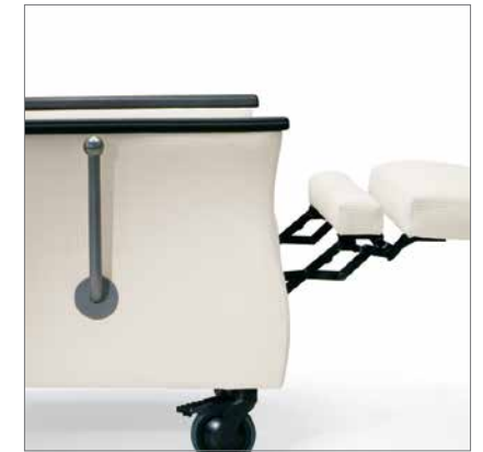
Independently operated back and footrest with infinite adjustability within a given range allows for a variety of positions.