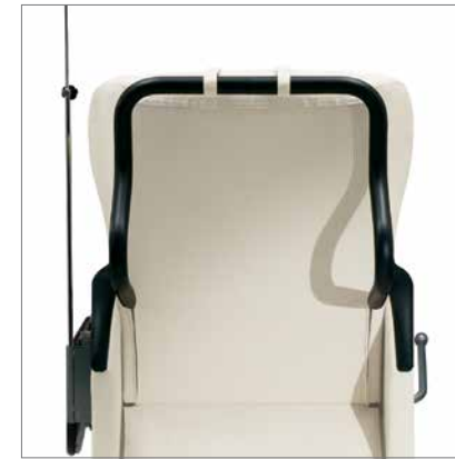
Optional padded push bar accommodates caregivers.