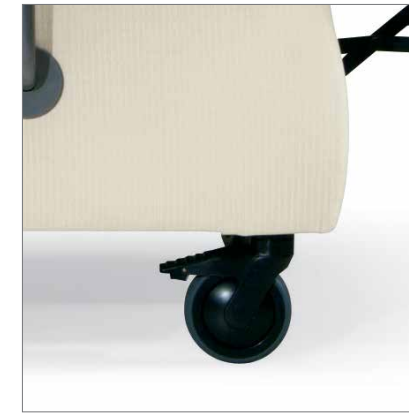
5" (13cm) casters, or optional central brake and steer.