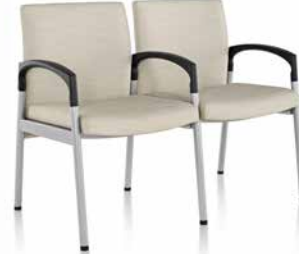
Two seat with intervening arm and leg