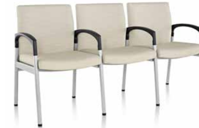
Three seat with intervening arms and legs