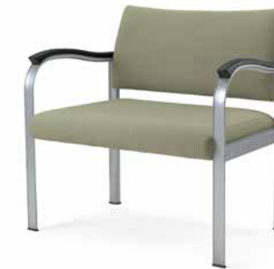
Plus chair with black urethane arm caps