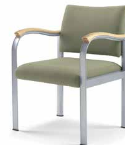
Chair with wood arm caps