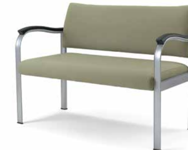
Settee with black urethane arm caps