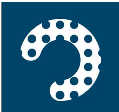
Step 2: Due to the positive and negative ion exchange, there is deep penetration into the core membrane.