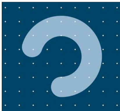
Step 1: Microbes are attracted to treated surfaces and punctured.

The treatment uses a three-step process to eliminate cell membranes (microbes):