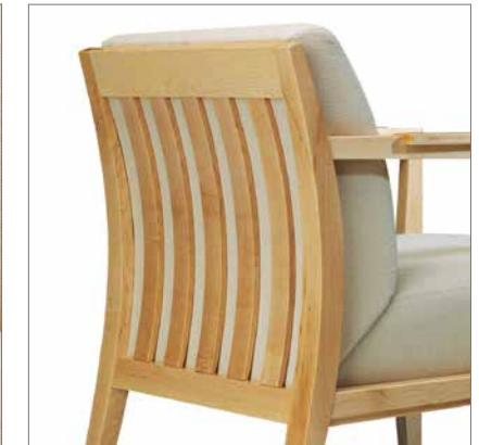
Design versatility with optional wood back or upholstered back with wood slats.