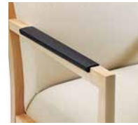
Black urethane inset (optional)