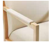
Upholstered inset (optional)