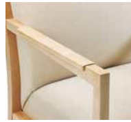
Wood inset (standard)