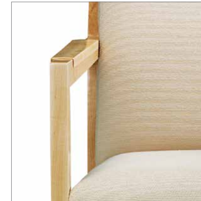
Choice of standard wood arm inset (shown) or optional upholstered or urethane arm inset.