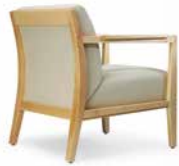
Upholstered back (standard)