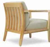
Upholstered back with wood slats (optional)