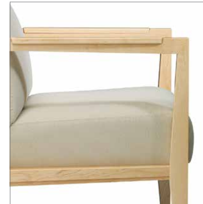
Open arms and a clean-out design allow for easy maintenance.