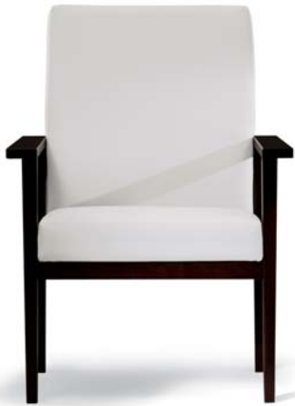
286-51, Patient Highback